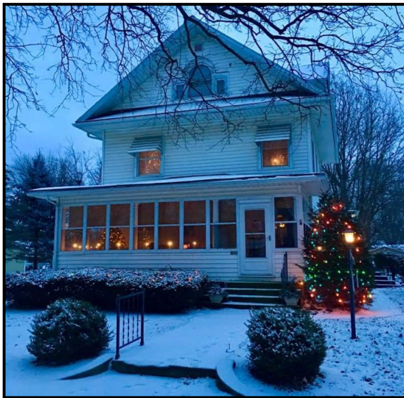
Maland Home at dusk