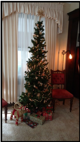
1st floor Dining Room Scandinavian Straw Ornaments