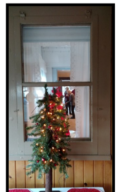
View from the back porch