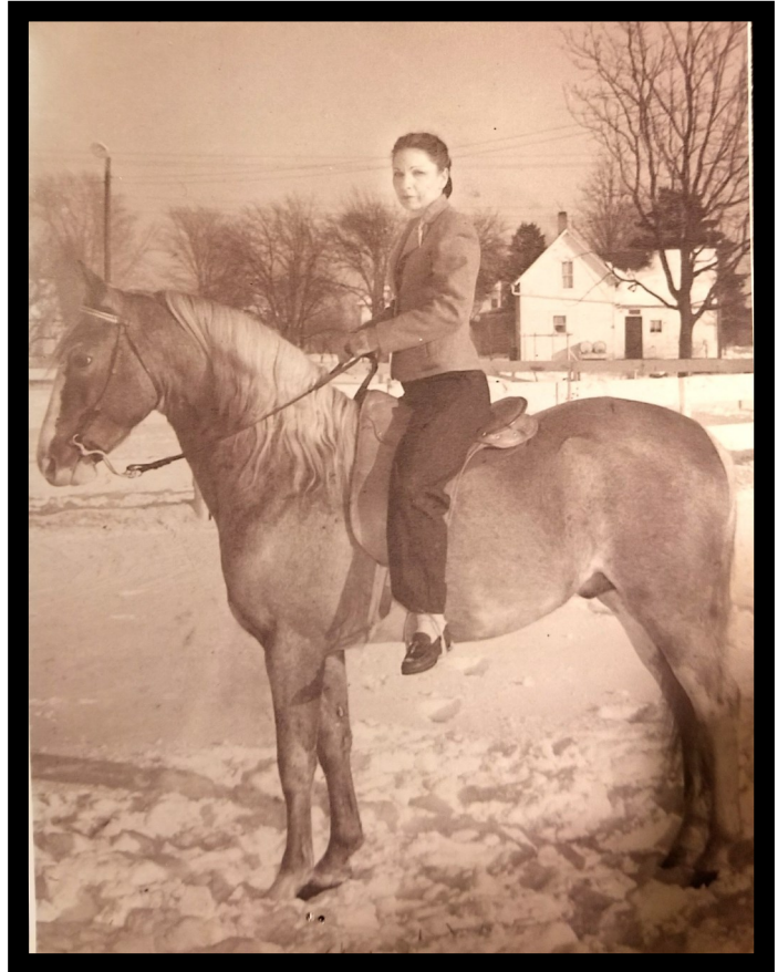
Mom on her horse Stonewall Eagle ~ son of Champion ~ Gene Autry's horse~