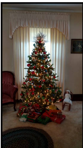
1st floor Living Room 1920's themed tree