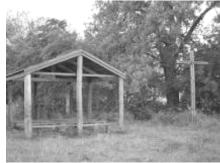
Replica of the first meeting place near the current day Palestine Church location.

The report of the committee of four continued: From Norway’s mountain passes we came, where we had to break stony ground of steep hills between flood and slides, where the pastures lay in ice-bound and shady hills. In Iowa, we can comfortably stretch our limbs in peaceful pursuit following plow and scythe, and the rich soils will abundantly repay us for our work.